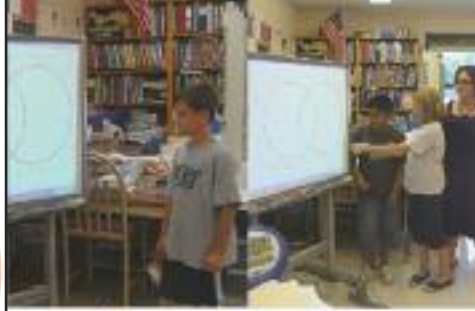
WOODBULL 4TH GRADE SMART BOARD