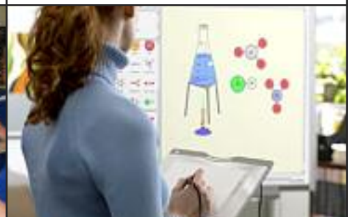
FLOWER HILL WIRELESS AIRLINER