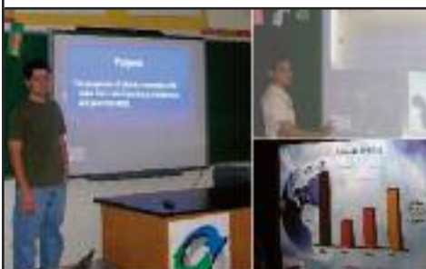
HHS - BIOLOGY CLASS COMING TO LIFE - SMART BOARD