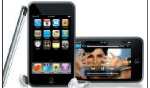
HHS- APPLE ITOUCH