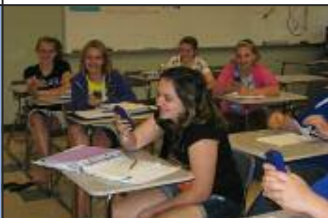
SOUTHDOWN PRIMARY SENETEO INTERACTIVE RESPONSE