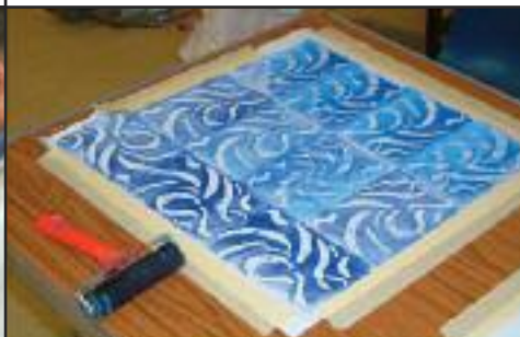
HHS - ART DEPARTMENT PRINTMAKING

I am overjoyed by the Board's decision! I want to thank the board for your personal support and interest in the "Printing Across Curriculum" Star Grant. With your grant the corner stone for learning and enhancing each student's creative process has been set in place.