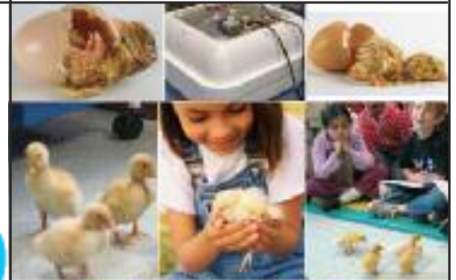
FLOWER HILL PRIMARY FROM CHICKEN TO EGG