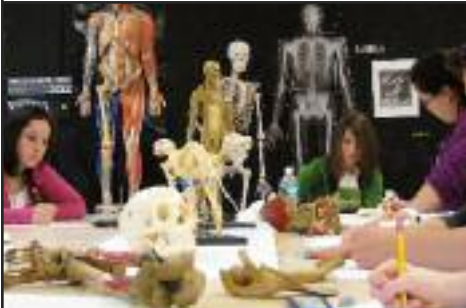
HHS - A/P ART CLASS ANATOMICAL MODELS