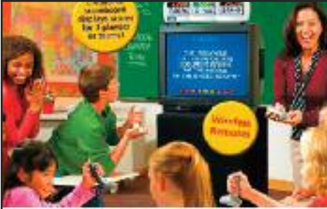
WASHINGTON PRIMARY 3RD GRADE - JEOPARDY IN THE CLASSROOM

Washington Primary School gives thanks to the Huntington Foundation for the generous grant they have awarded us.