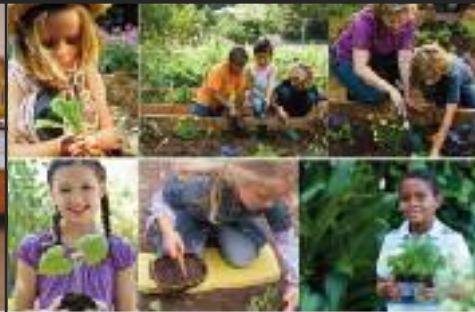
JEFFERSON 2ND GRADE VEGETABLE AND HERB GARDEN