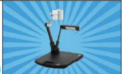
WOODHULL DOCUMENT CAMERA