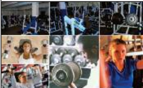
PARTIAL GRANT FOR RENOVATION OF HHS WEIGHT ROOM