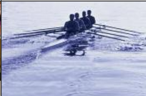
HHS- CREW TEAM