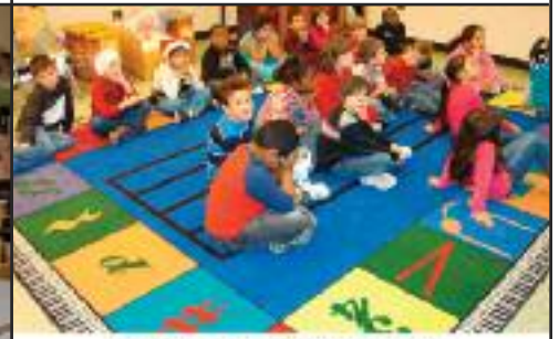
JEFFERSON PRIMARY - MUSIC CLASS NOTEWORTHY CARPET