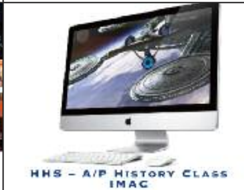
HHS - A/P HISTORY CLASS IMAC