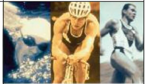
TRIATHALON CLUB AT HHS TRIATHALON GRANT