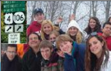
HHS - SOCIAL STUDIES VERMONT EXCHANGE PROGRAM

The Woodstock Exchange Program was a great experience. Everyone took part and learned a great deal... Being able to live in a different community with kids your own age was really eye opening... When it was our turn to host the exchange program the Huntington HS students were jumping at the chance to bouse their new friends. The Vermont Exchange Program