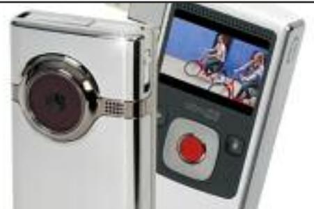
WASHINGTON PRIMARY LETS PRESENT STAR GRANT