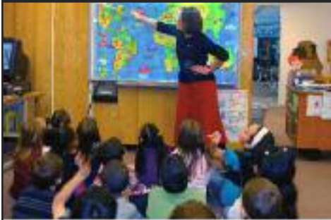
JEFFERSON PRIMARY SCHOOL- SMART BOARD