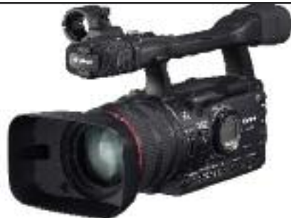
HHS- VIEW THE WORLD IN HD