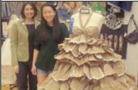
HHS - STUDIO IN FASHION DESIGN