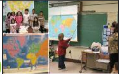
WASHINGTON PRIMARY SCHOOL MAPS AND GLOBES