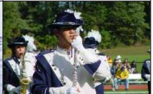
HHS- MARCHING BAND

The Woodstock Exchange Program was a great experience. Everyone took part and learned a great deal... Being able to live in a different community with kids your own age was really eye opening... When it was our turn to host the exchange program the Huntington HS students were jumping at the chance to bouse their new friends. The Vermont Exchange Program