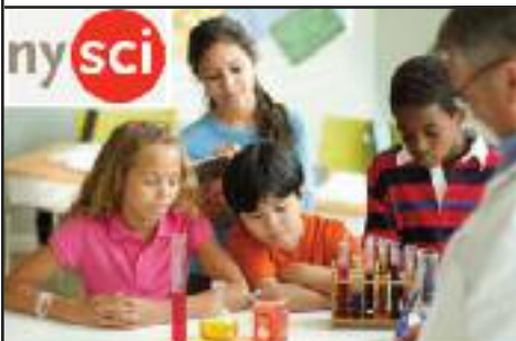
HUNTINGTON PRIMARY SCHOOLS SCIENCE CONNECTION