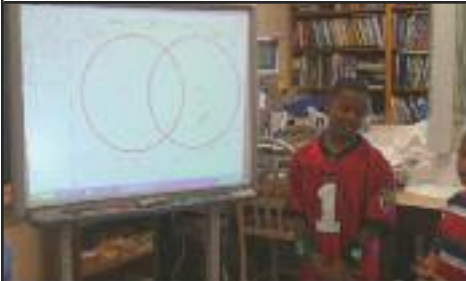
JEFFERSON PRIMARY 2ND GRADE - SMART BOARD

I would like to take this opportunity to thank the Huntington Foundation for all their help and support. It is my hope that this exposure to technology will allow students to become computer literate at an early age. It has enhanced their learning experience.