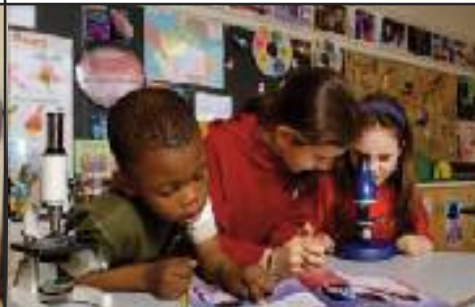
HUNTINGTON SCIENCE DEPARTMENT MICROSCOPES