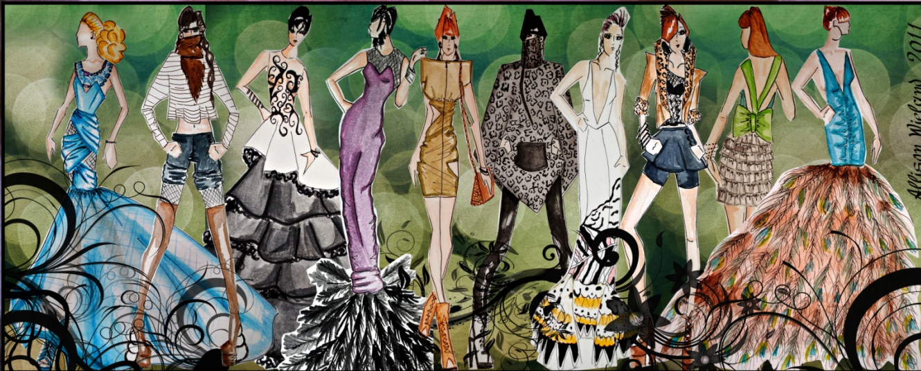
Artwork by Allison Wieland. It is located outside the café in the science wing.