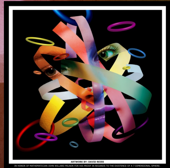
Artwork by David Reiss It is located in the math wing.