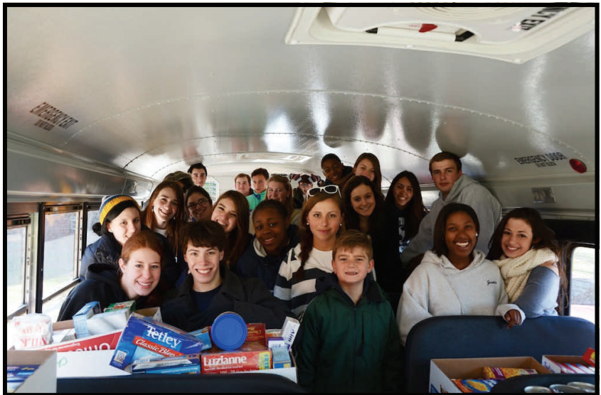
Awesome Teenagers: Huntington High School students collected an enormous amount of food and related items-enough to stuff a full-size school bus during the "Stuff the Bus" campaign. The bus, which was donated for the day by Huntington Coach Corp., was used to deliver the goods to organizations committed to helping the homeless and hungry in the community.