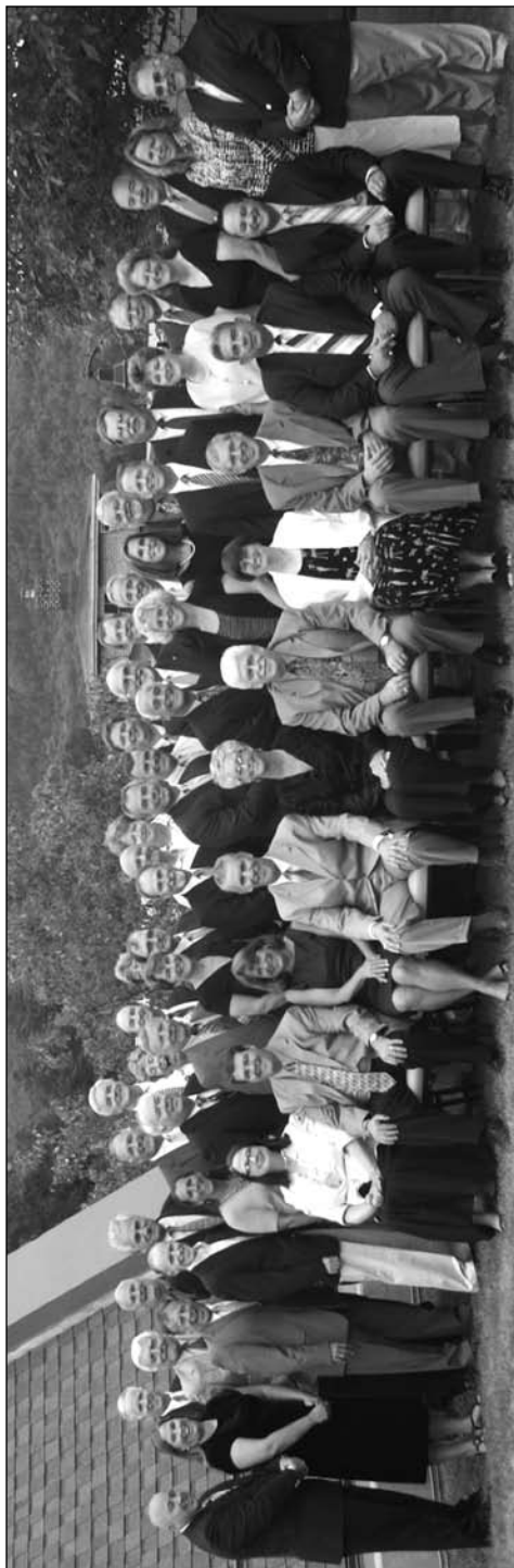
2011 Central Committee