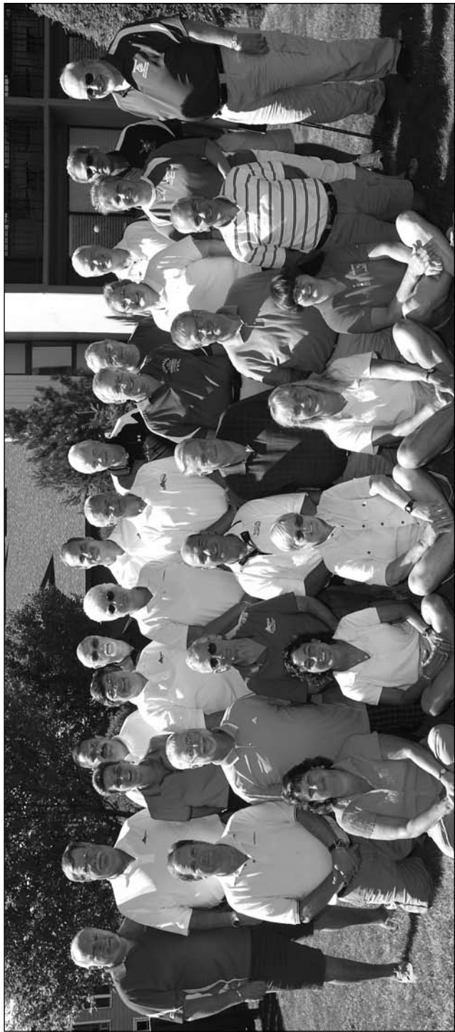
2011 Sport Coordinators