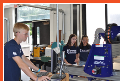
Robotics students at work on the CNC Milling Machine