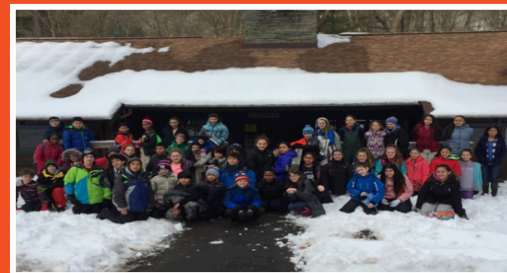
6th Graders at Greenkill