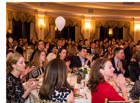
The Huntington community having a great time at the 2017 Gala.