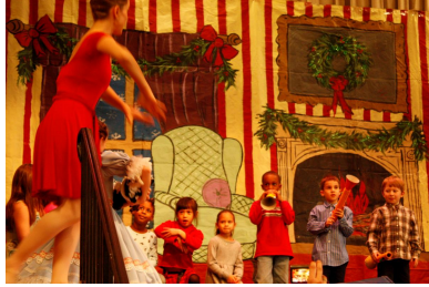
First graders participating in a special performance of "The Nutcracker" in December.

The Kindergarten students are approaching a very exciting milestone of their first year - completion of 100 days in school! To celebrate the 100th Day of School, the teachers will prepare the Kindergarten classes for a fun and memorable day as they parade the halls. More information will be provided in the coming weeks.