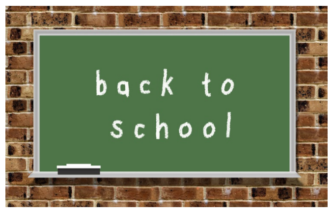
Fourth Grade Supply List