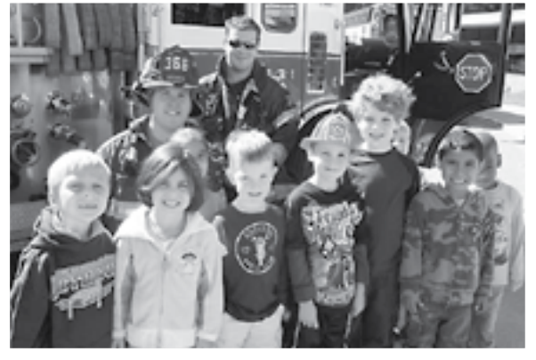
Jefferson Students with the Huntington Fire Dept.