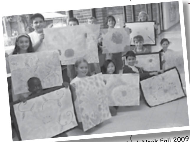
Book Nook Fall 2009

2nd grade- learned about the Russian artist called the "father of Abstract art" and his name is Wassily Kandinsky. The students recreated one of his circle themed abstract paintings by using tempera paint and a sponge. then colored paper, doilies and printed circles done with cups and cork were all added to get a circle shape on their picture. The next thing they learned was a Silhouette painting by using bright colors painted for a background with dark black lines on top of this bright background to create a silhouette