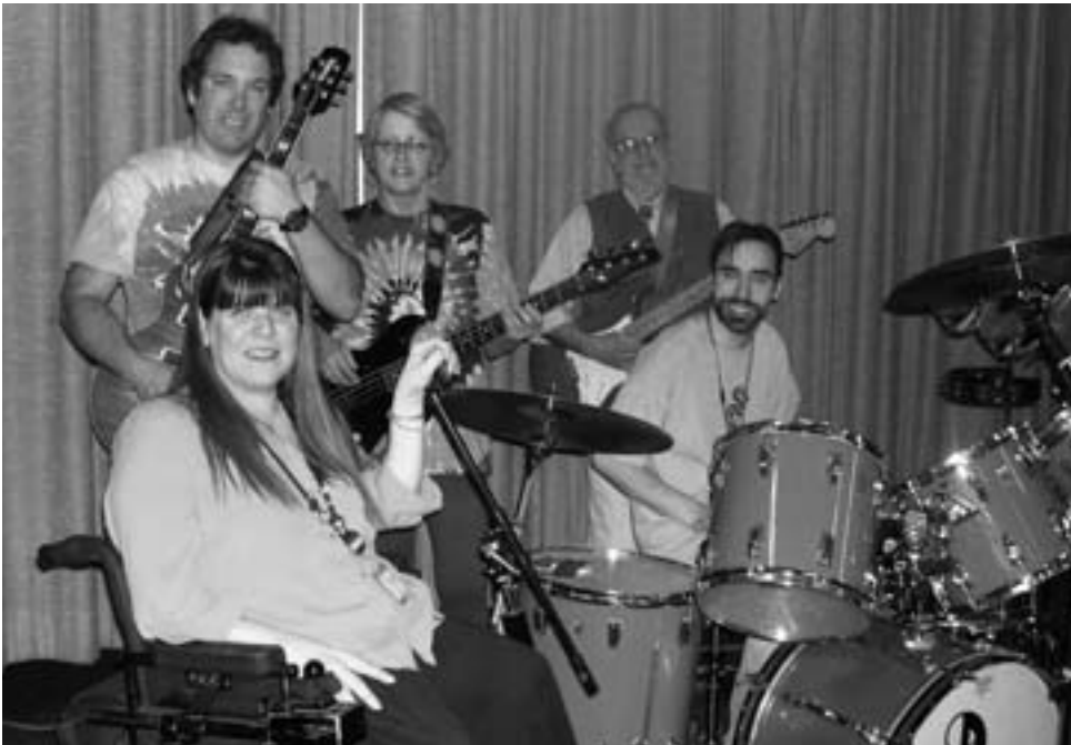
Range of Motion Band benefiting from Grantee Coalition for Diasabled Musicians

JPMorgan Chase Organization/Stabilization Regrant Program The Organization/Stabilization Regrant is made possible through the JPMorgan Chase Regrant Program. It provides small to mid-sized organizations in Nassau and Suffolk Counties an opportunity to apply for grant awards up to $3,000 dollars. The program supports projects, services and capital expenditures focused on strategic planning, organizational development and capacity building for Non-Profits that demonstrate no less than a three year history of continuous cultural activity as an organization qualified under 501(c)3.