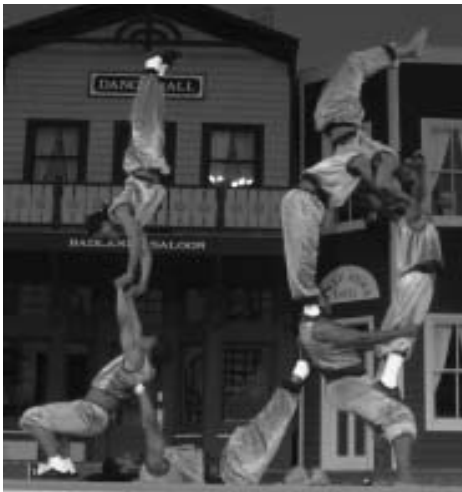
African Acrobats from Kenya