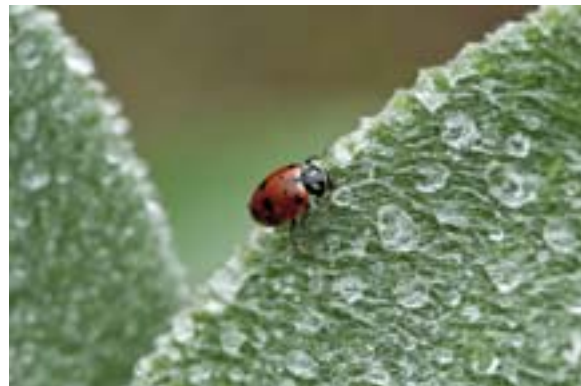
Ladybug by Yvonne Berger

Yvonne Berger will be the juror for the 10th annual juried Photography exhibit. Prospectus available at www.huntingtonarts.org . Entry deadline Friday, March 22, 2013. Opening reception Friday, April 26, 2013 6pm-8pm.