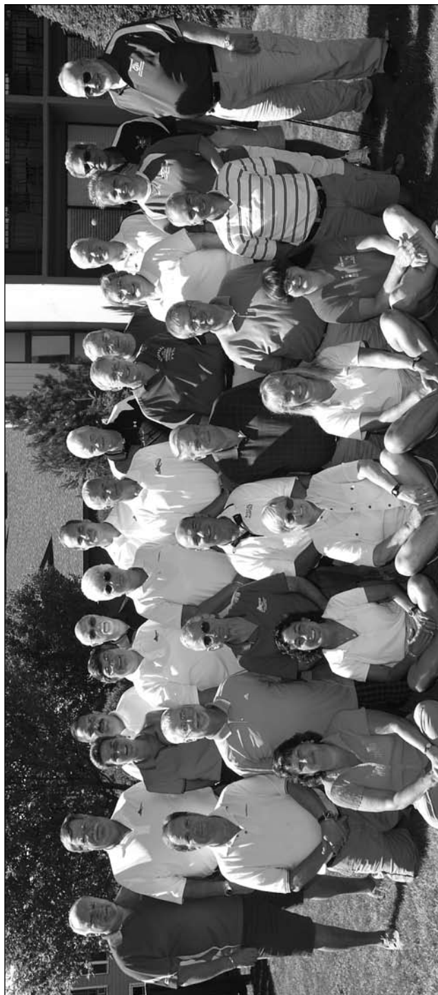
2011 Sport Coordinators