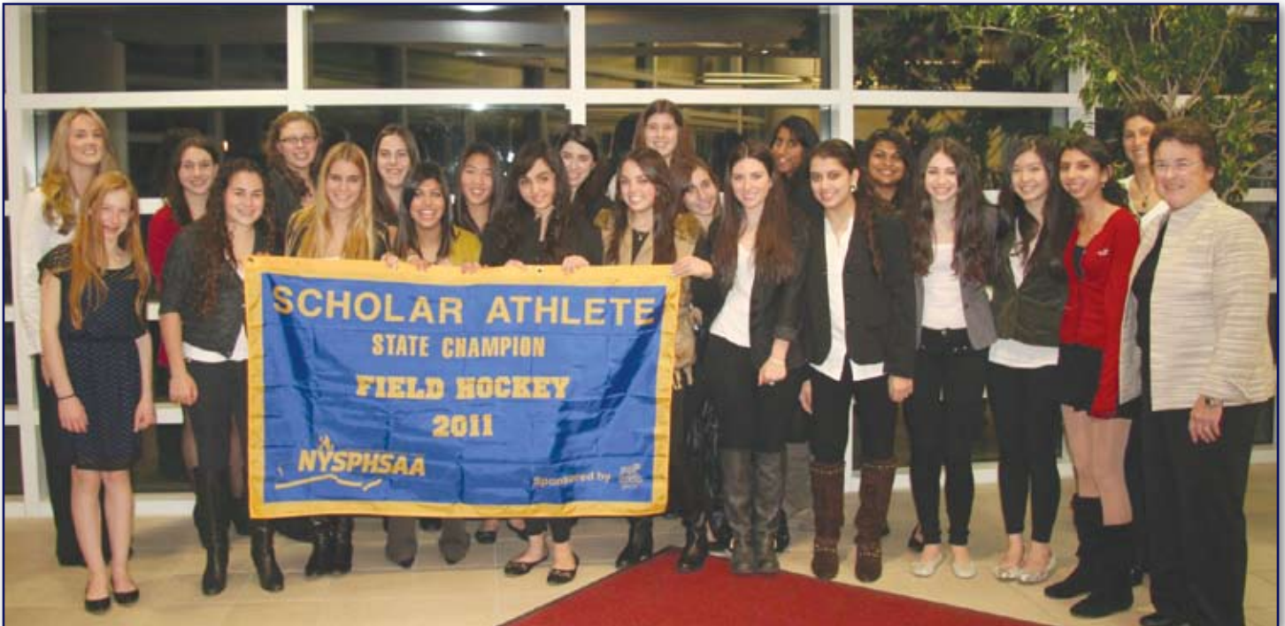
WHEATLEY SCHOOL'S FIELD HOCKEY TEAM