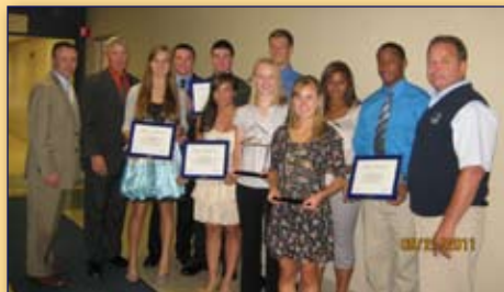
Albion, Newfane, Williamsville North & Wilson