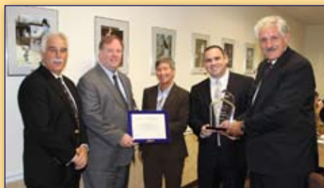
Commack High School