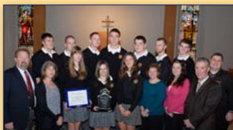
Saratoga Catholic Central School