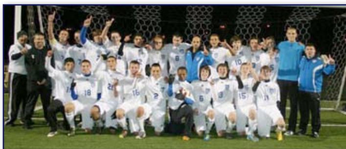
Coxsackie-Athens CSD - Boys Soccer Team