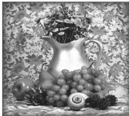
Artwork by EVIAN WILLIAMS

This is a third level course. This course will introduce students to career paths in the fashion industry. The emphasis will be on practical application of disciplines learned in prerequisite fashion courses. Fashion III features opportunities to apply previous studies to real world applications. Students will design for both mass and niche markets, combining creativity with marketability and practice production planning from both a local and global perspective. Students will assemble a professional portfolio of illustrations or sewn garments. Marketing and the business of fashion will be stressed through the design and production of a quarterly fashion publication and hands on fashion show responsibilities. The final quarter culminates in a fashion show presented at the yearly art show.